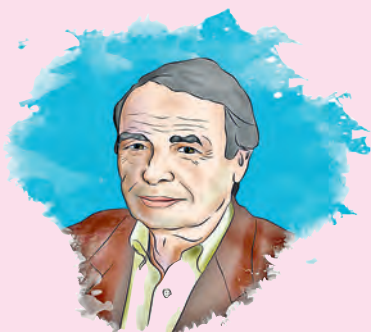
Figure 2: Pierre Bourdieu (1930-2002)

(1) Wealth and Income: Possession of substantial amounts of wealth is the main characteristic distinguishing the upper class from other class groups in society. Persons having more wealth and income generally have higher social position and respect in society. Though,